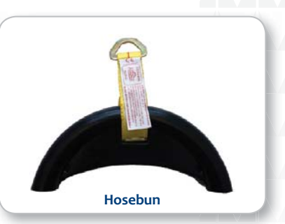
Available sizes: 1", 1\frac{1}{4} ", 1\frac{1}{2} ", 2", and 3".