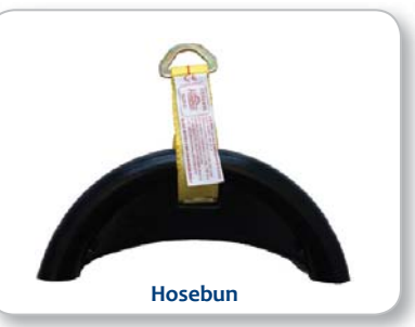
Available sizes: 1" 11/4" 11/4" 2" and